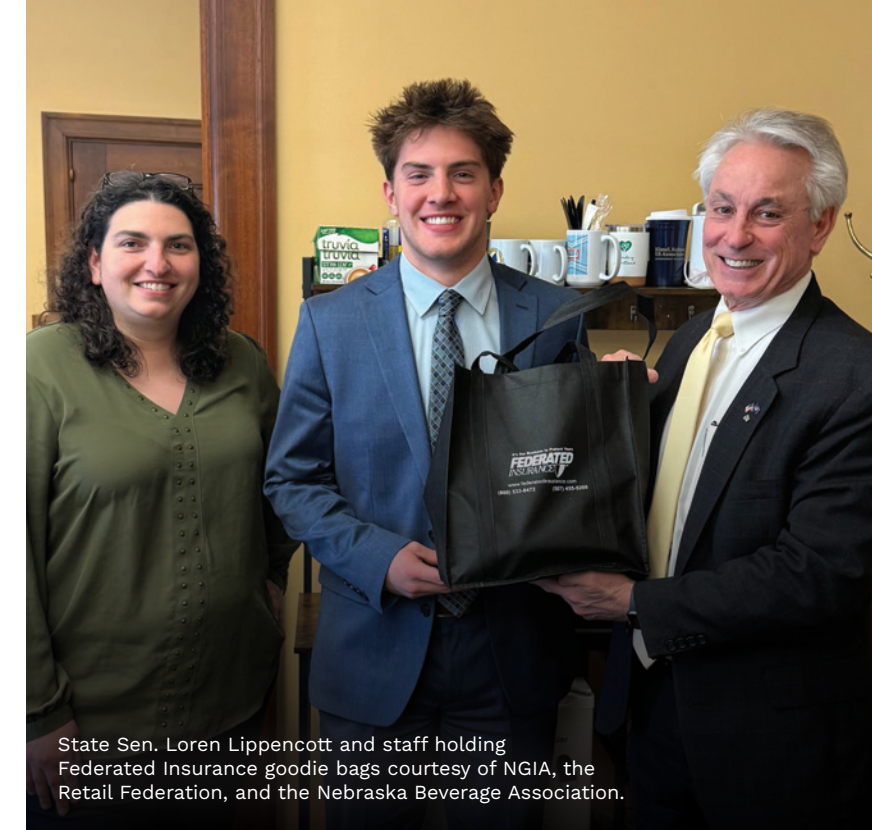
State Sen. Loren Lippencott and staff holding Federated Insurance goodie bags courtesy of NGIA, the Retail Federation, and the Nebraska Beverage Association.

A: What truly sets Federated apart is our industry-specific approach. We don't believe in one size-fits-all insurance. Instead, we offer tailored risk management solutions designed specifically for grocery retailers. Our clients benefit from dedicated local representatives, access to risk management resources, and a proactive approach to loss prevention that helps protect both people and property.