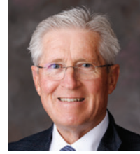
41 Fred Meyer St. Paul 402-471-2631