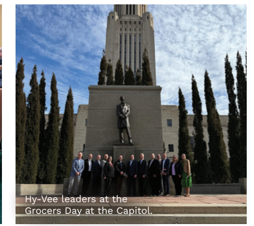
Hy-Vee leaders at the Grocers Day at the Capitol.